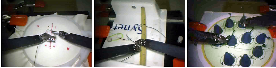
Fig. 2: Snapshots of the three surgical tasks in the JIGSAWS dataset (from left to right): suturing, knot-tying, needle-passing [7].

In order to classify an unlabeled kinematic data, the method transforms it into a terms frequency vector using exactly the same sliding window and SAX parameters used for the training part. It computes the cosine similarity measure (Eq. 4) between this term frequency vector and the N tf*idf weight vectors representing the training classes. The unlabeled kinematic data is assigned to the class whose vector yields the maximal cosine similarity value.